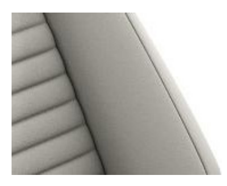
"Alcantara"/ "Vienna" leather Mistral (YR) Standard on Elegance/ R-Line models