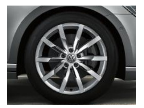
STANDARD ON R-LINE MODELS 18" 'Monterrey' alloy wheels in grey metallic 8J x 18 Tyres: 235/45 R18