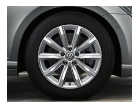
STANDARD ON BUSINESS MODELS 17" 'London' alloy wheels 7J x 17 Tyres: 215/55 R17

The addition of optional extras may result in the vehicle increasing in Co2 g/km and therefore, attracting a higher rate of VRT than described in this product guide. For your exact configuration value, both Co2 g/km and RRP, please visit volkswagen.ie configurator.