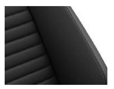
"Nappa" leather (WL7) Titan Black/Blue(TO) Optional on Elegance/ R-Line models