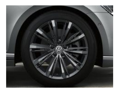
OPTIONAL ON R-LINE & GTE MODELS 18" 'Liverpool' alloy wheels in Admantium Dark 8J x 18 Tyres: 235/45 R18