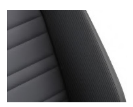
"Carbon-Flag"/Vienna (W05) Flint Grey/Titan Black (OK) Optional on R-Line models

Note 1: Some parts of leather interior trim will contain artificial leather. Note 2: The print processes do not allow exact reproduction of the upholstery & insert colours.