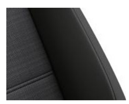
"Weave" cloth Titan Black/Blue (TO) Standard on Business models