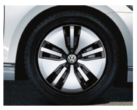
STANDARD ON GTE MODELS 17" 'Montpellier' alloy wheels 7J x 17 Tyres: 215/55 R17