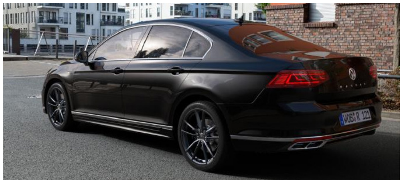
Note: The above image shows 'R-Line' Model with optional 'Pretoria' 19" alloy wheels in optional Matte Dark Graphite paint and optional Matrix LED package.

The above specifications are for information purposes only as our products are continually updated and changes may be made to the specifications at any time. If you require any specific feature, you must consult your local dealer who is regularly updated with any change in specifications. Specifications are subject to change without notice. Effective from 01 January 2022, for production from CW48/2021 onwards. All prices include VAT and VRT. These prices are subject to change once technical data comes available.