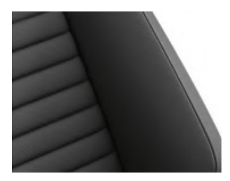
"Vienna" leather (WL1) Titan Black/Blue (TO) Optional on Business models