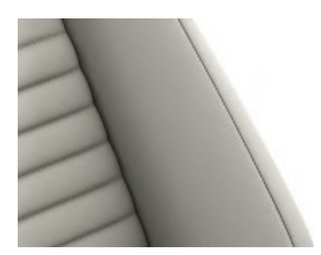
"Vienna" leather (WL1) Mistral (YR) Optional on Business models