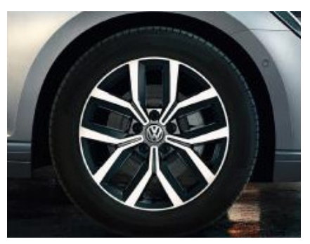
STANDARD ON ELEGANCE MODELS 17" 'Nivelles' alloy wheels 7J x 17 Tyres: 215/55 R17