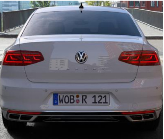
Note: The above image shows 'R-Line' Model with optional Matrix LED package.