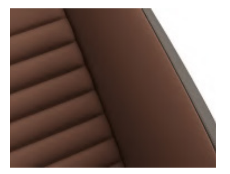
"Nappa" leather (WL7) Florence/Titan Black (DN) Optional on Elegance/ R-Line models Note: Requires PDS Black Headliner