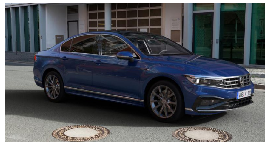
Note: The above image shows 'R-Line' in Lapiz Blue with 'Monterrey' 18" alloy wheels in Grey Metallic and optional Matrix LED package.