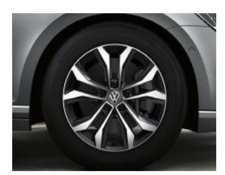
OPTIONAL ON BUSINESS & ELEGANCE MODELS 17" 'Soho' alloy wheels with diamond turned suface 7J x 17 Tyres: 215/55 R17