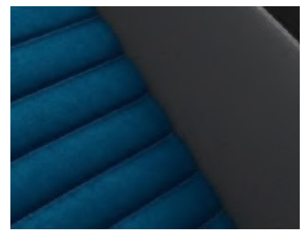
"Alcantara"/ "Vienna" leather Aquamarine/Titan Black (CM) Standard on Elegance/ R-Line models