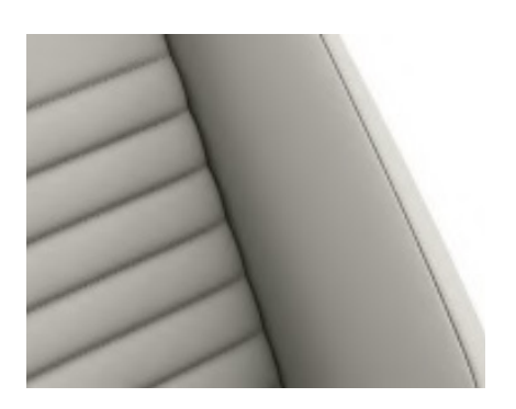
"Nappa" leather (WL8) Mistral (YR) Standard on GTE models

Note 1: Some parts of leather interior trim will contain artificial leather. Note 2: The print processes do not allow exact reproduction of the upholstery & insert colours.