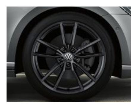
OPTIONAL ON R-LINE MODELS 19" 'Pretoria' alloy wheels in Matte Dark Graphite 8J x 19 Tyres: 235/40 R19

The addition of optional extras may result in the vehicle increasing in Co2 g/km and therefore, attracting a higher rate of VRT than described in this product guide. For your exact configuration value, both Co2 g/km and RRP, please visit volkswagen.ie configurator.