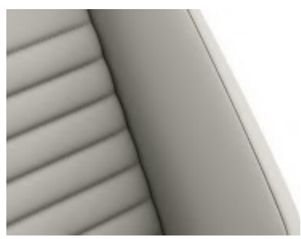
"Nappa" leather (WL7) Mistral (YR) Optional on Elegance and R-Line models